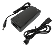
Power Supply & Cable